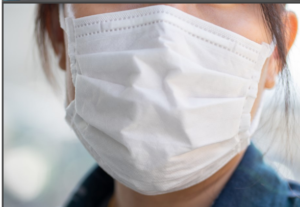
We're requesting our patients apply hand sanitizer and wear a face mask upon entering our front office.